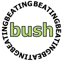
Beating Around the Bush

See if you can figure out what these tricky brain teasers are trying to say.